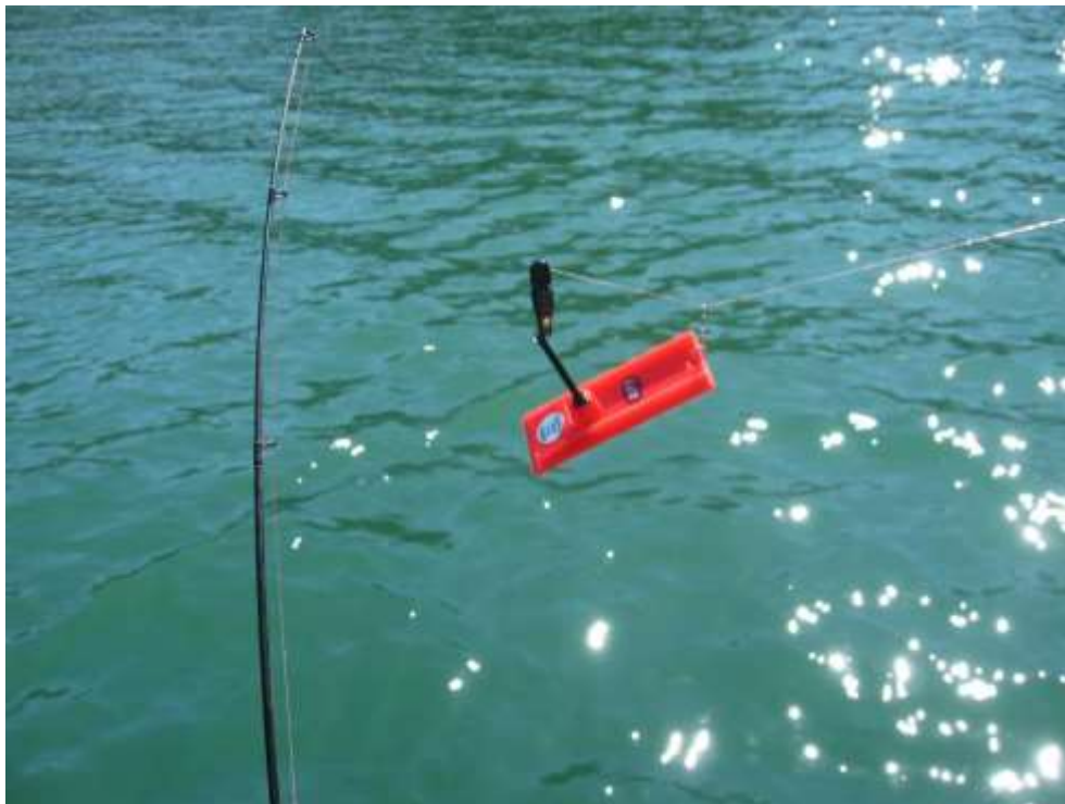
Attach the swivel to the line then attach the Pro Side Planer to the line so the arm is towards the tip of the rod.