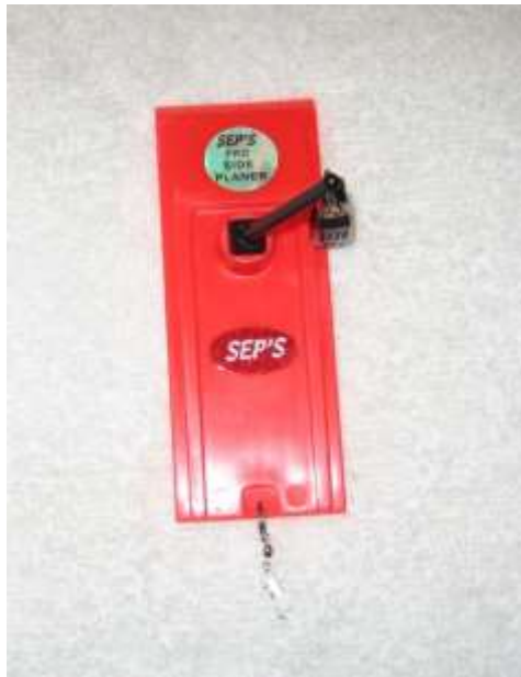
Rigged for starboard side.