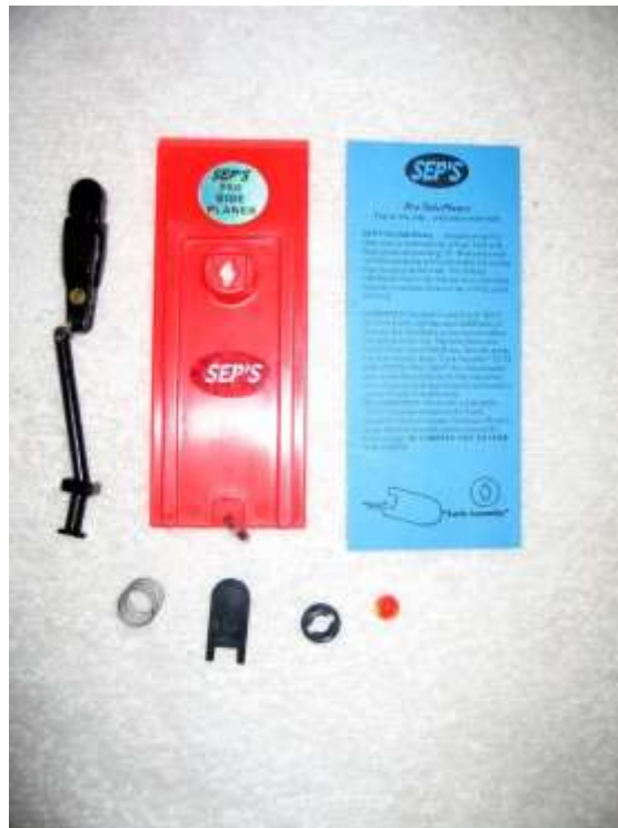
All the necessary parts of the Pro Side Planer.

Use SEP'S Pro Side Planer to intercept fish that are spooked to the side of your trolling boat/motor. The fluorescent red color of SEP'S Pro Side Planer, plus the simple and ultra-light design make it a favorite with trout and kokanee anglers. The lure/grub is slowly trolled to the side of the boat, just five feet below the surface, simple and effective, sideplaners put offerings where the fish are, without spooking them.